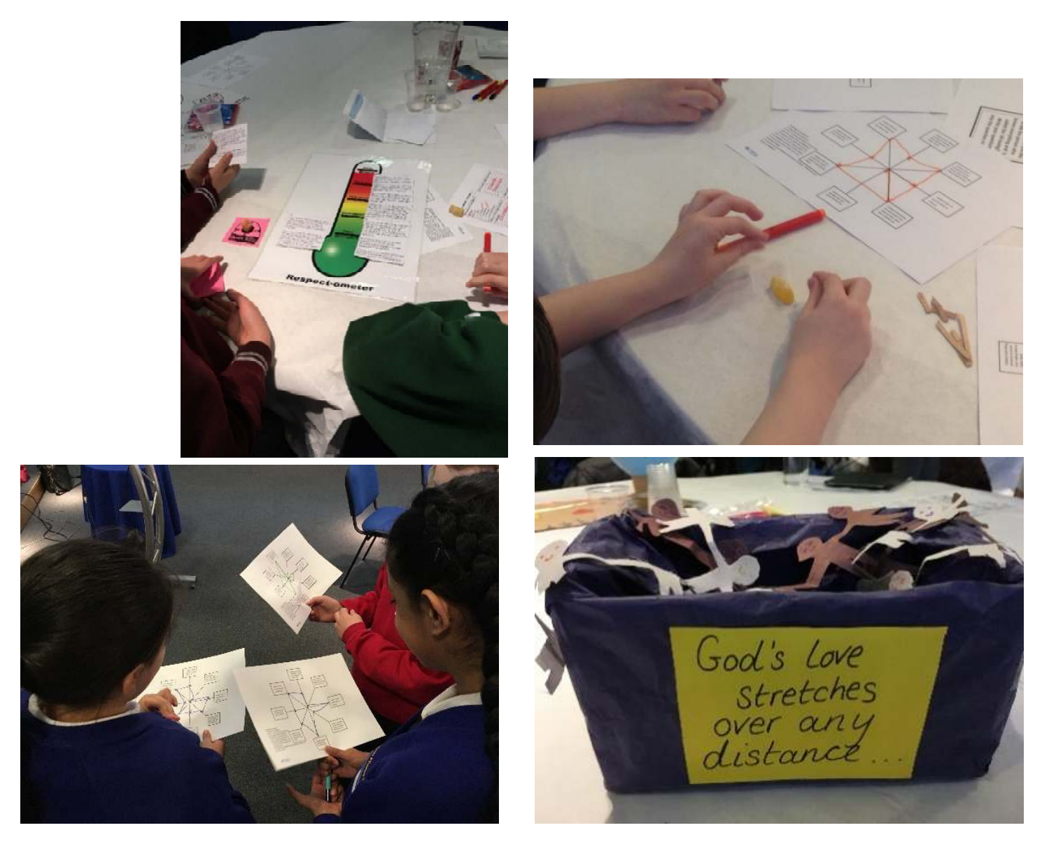
Stoke SACRE RE and Respect for all days March 2018