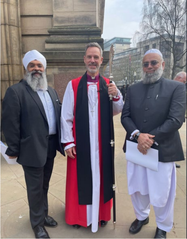
Image of Coventry and Warwickshire Joint SACRE meeting

RE Facilitator attended the West Midlands Commonwealth celebration with several faith leaders from across the area.