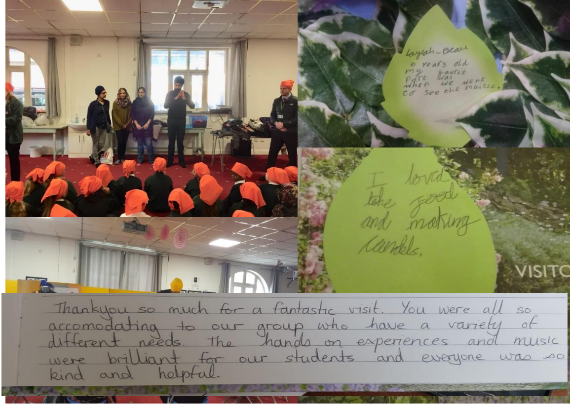
Pupils from Warwickshire have visited places of worship locally, including this gurdwara in Coventry.

9) The RE Facilitator attended the local NATRE group meeting (North Warwickshire) in order to offer further support to secondary RE teachers. This session was also attended by a member of the Schools Team from Coventry Cathedral and had a peace and reconciliation theme to it.