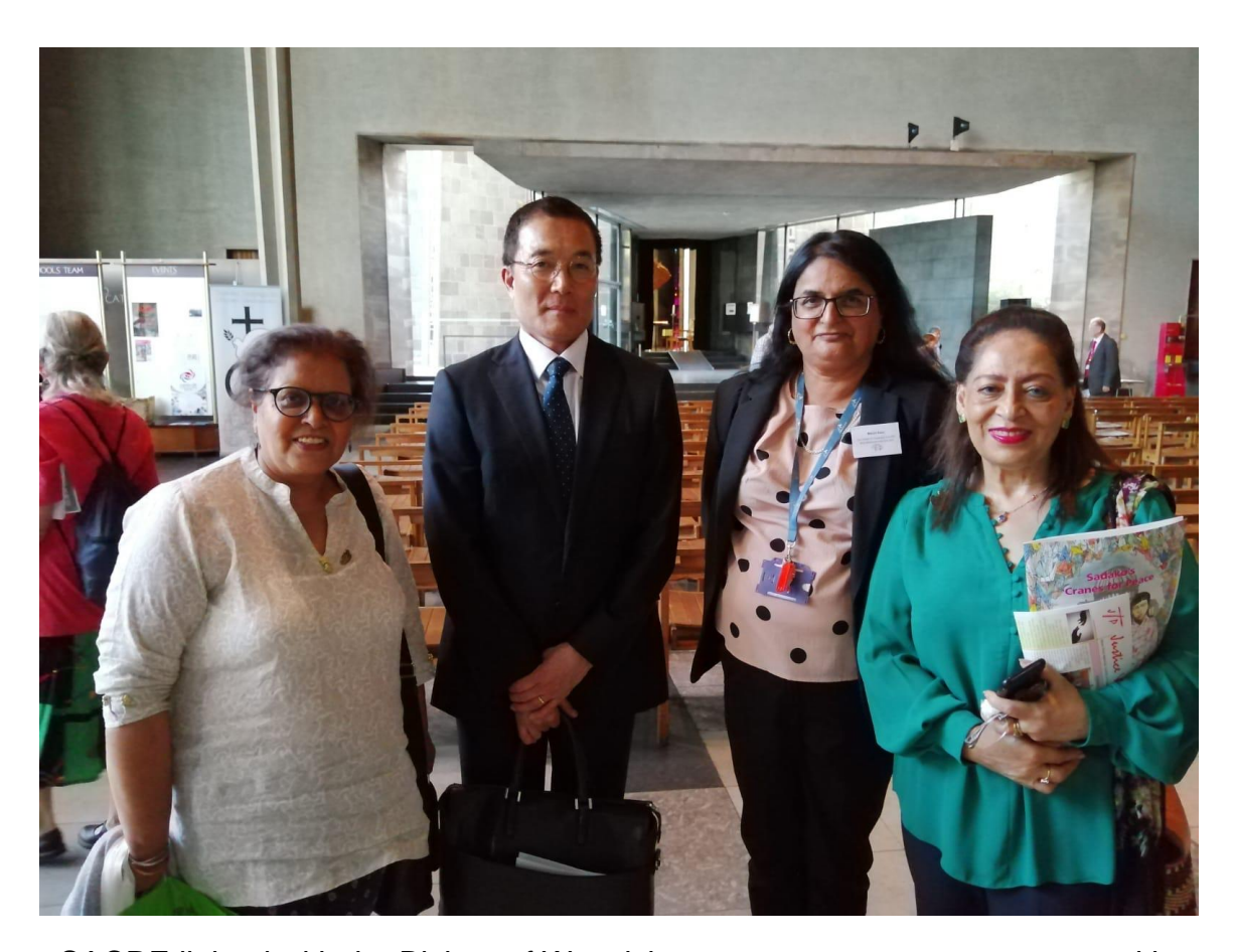
SACRE liaised with the Bishop of Warwick to ensure a peace poem competition, such as that which runs in Coventry, could be established and open for Warwickshire schools to apply.