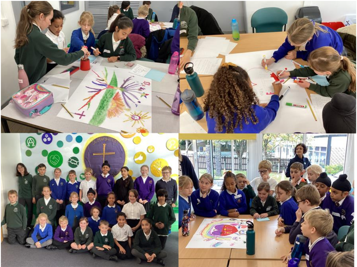
Pupils at the 'What is Faith?' conference