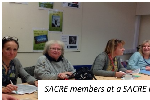
SACRE members at a SACRE meeting