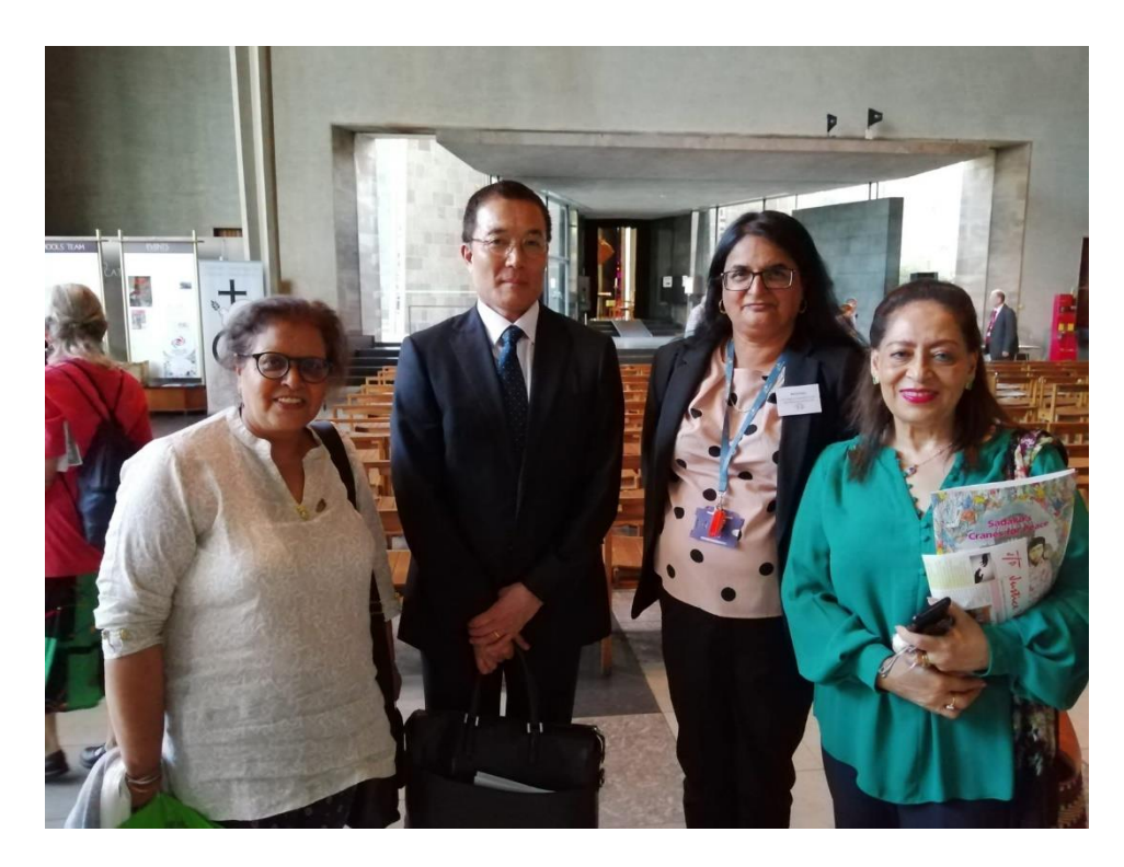
The RE Facilitator met with representatives from two local teacher training providers to support trainee teachers and NQTs in their RE teaching. A survey for trainees was produced to allow trainees to share their experiences of teaching RE on placements and to tailor support offered in the future.