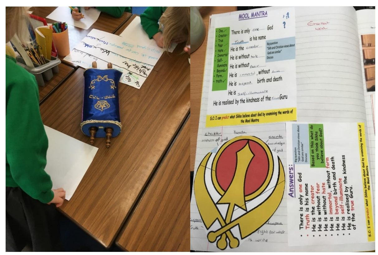
RE work observed during RE Monitoring visit