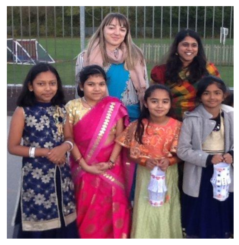
Pupils enjoying a Diwali Walk at a local primary school