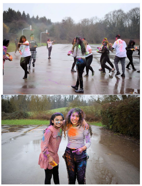
The Hindu festival of Holi being celebrated at Blue Coat School, Coventry