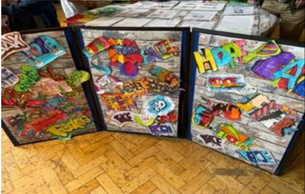
Appendix C. Some of the Heartstone Project Artwork