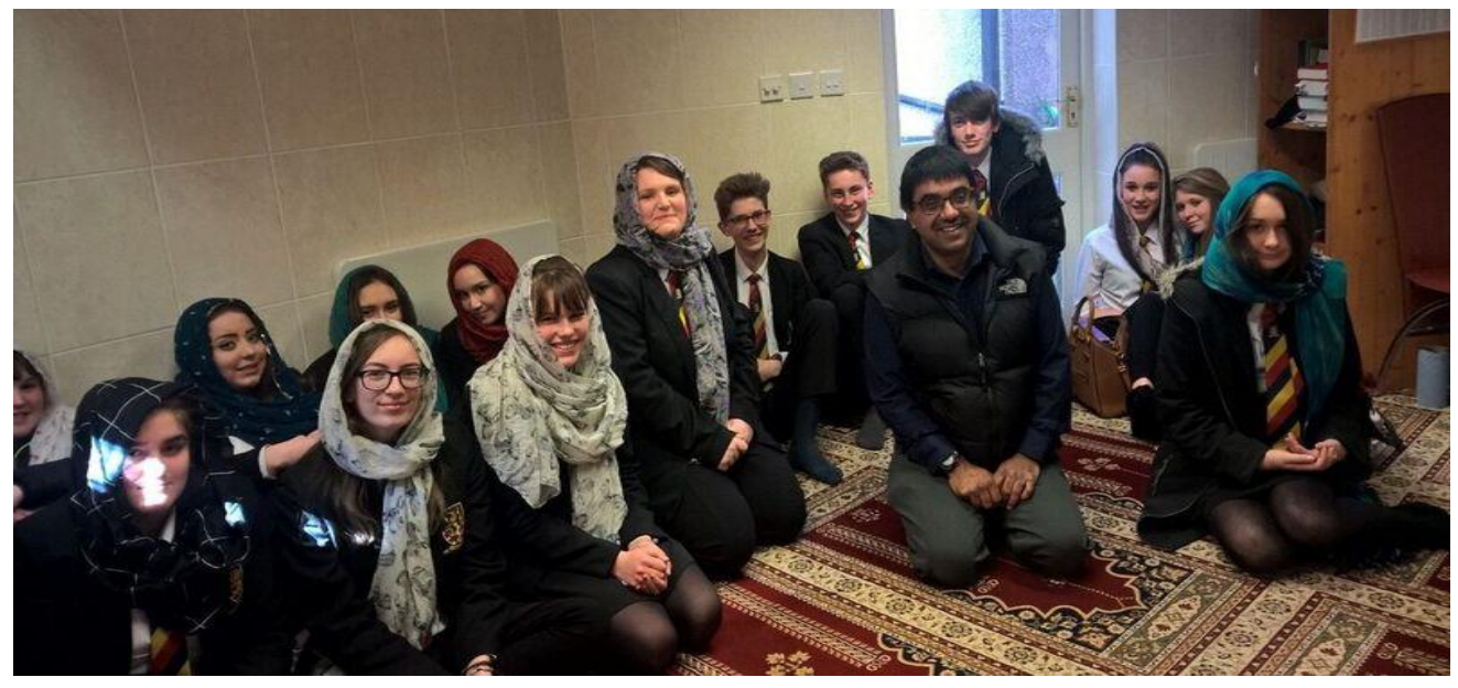
Teachers also had the opportunity to join a P4C enquiry with the pupils around the topic of negativity portrayed in the media towards Muslims.