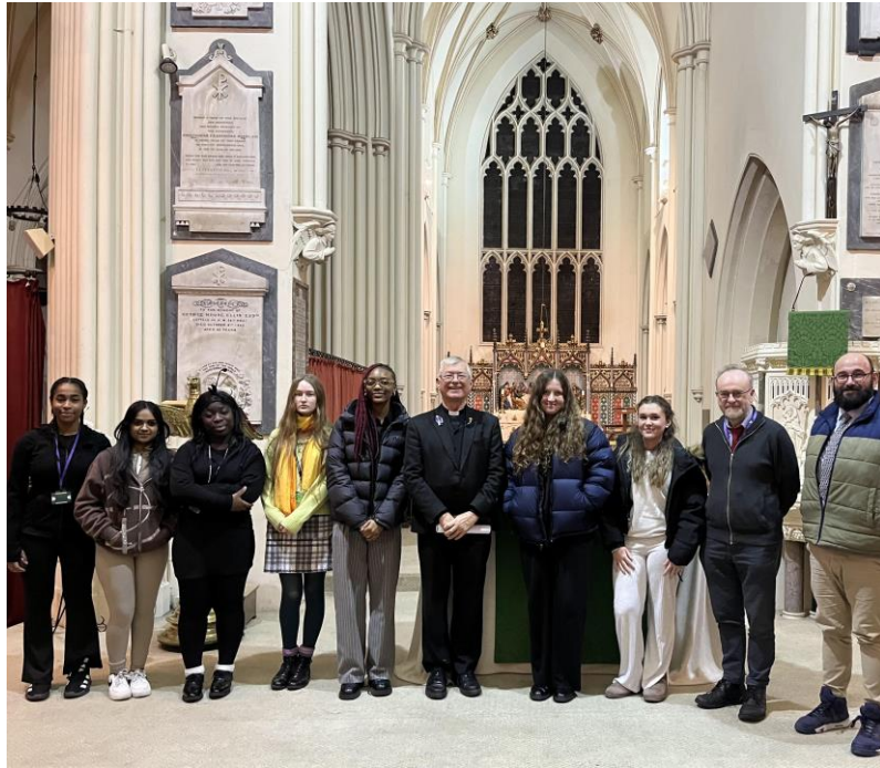
Initial session at St Peter and St Paul Church Mitcham