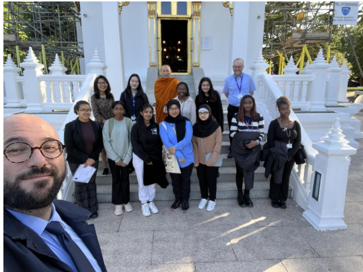
Final session with certificates at the Buddhist Temple in Wimbledon

6 th Form Interfaith Dialogue groups visit the Buddhist Temple, Ahmadiyya Mosque, Wimbledon Synagogue, Hindu Temple and St Peter and Paul Church as well as a discussion session on Humanism.