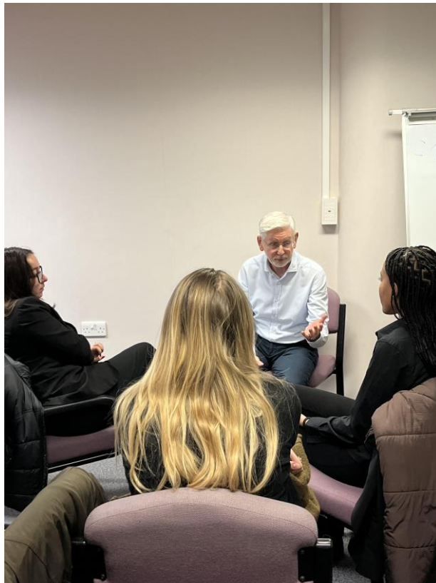
Discussion on Humanism at the Meron Civic Center