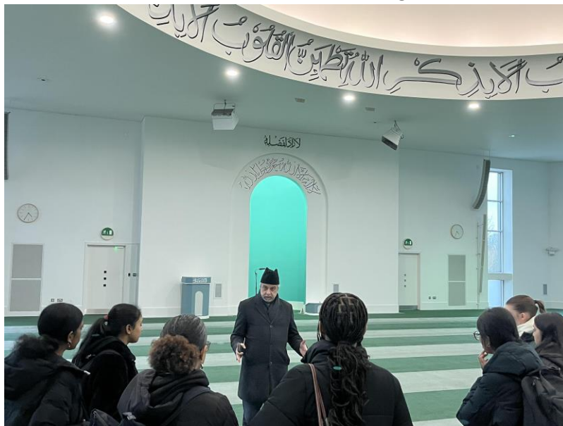
Ahmadiyya Muslim Community Mosque in Morden