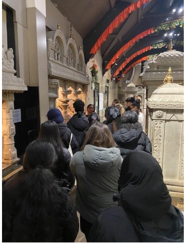
Shree Ghanapathy (Hindu) Temple in Wimbledon