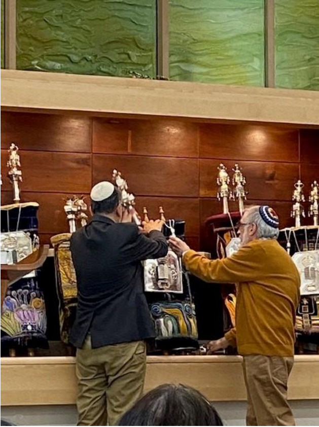
Wimbledon Synagogue (Jewish)