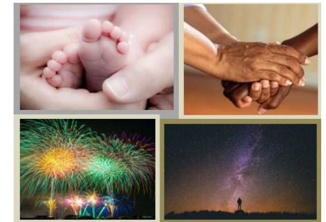
Lincolnshire Agreed Syllabus for Religious Education 2018-2023